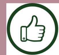
Do the Right Thing